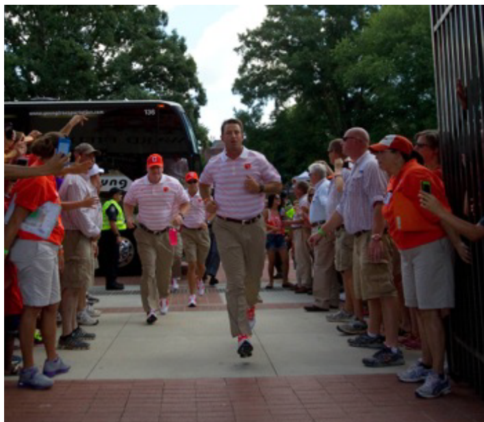
"I'm walkin on sunshiiiiine, woah-oh-oh!"